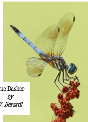
Blue Dasher by V. Berardi

*Entrance to the Township Hall is from the rear of the building (216 E. Monroe St.) where two parking lots are available for use. Mask wearing is encouraged but not required.