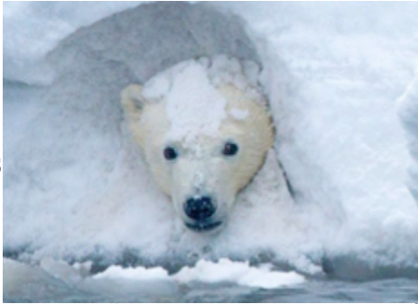
Polar bears are particularly at risk of dying in oil spills.

In the first week of January 2021, the Trump administration held the first sale for rights to drill for oil in Alaska's Arctic National Wildlife Refuge - but it drew no interest from major companies. An Alaskan state agency emerged as the primary bidder at the auction, which has been heavily criticized by environmental groups. The sale raised less than $15 million - far less than the government had hoped. Major companies, including oil giant Exxon, Shell and BP, have said they are focusing their spending on renewable energy, amid a huge slump in oil prices, in part triggered by the coronavirus pandemic. The wildlife refuge is estimated to hold some 1.1 billion barrels of oil.