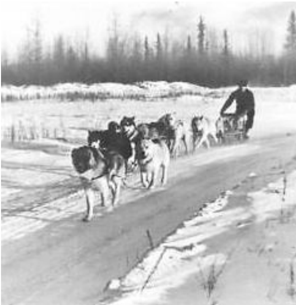
RPPC SLED DOG TEAM - Winter Snow Sled Scene with Huskies ca 1940s from a Vintage Postcard