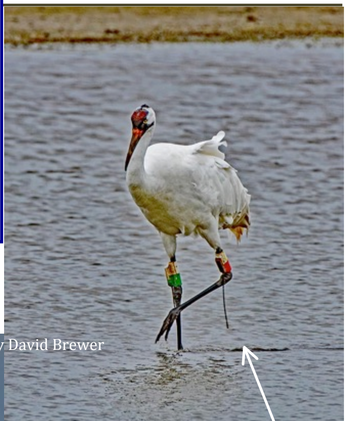
Note the colored identification bands and radio tracking devise with wire on this whooping crane's legs.

Scientist believe the world's people need to be persuaded to stop littering. Whether it's a bottle cap dropped along the sidewalk or balloons released for some event, it is all litter. To help reduce the mess: buy and use less plastic, carry purchases in reusable bags, reuse what you buy, recycle, say "NO" to balloon releases, and stop using products (body washes, facial scrubs & makeup) that contain microbeads. wwf.panda.org/about_our_earth/blue_planet/problems/pollution/