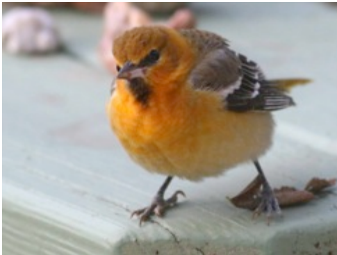
Bullock's Oriole