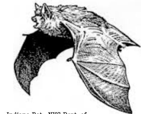
Indiana Bat - NYS Dept. of Environmental Conservation

Affiliate of the Illinois Audubon Society, the Illinois Environmental Council, & the North American Bluebird Society